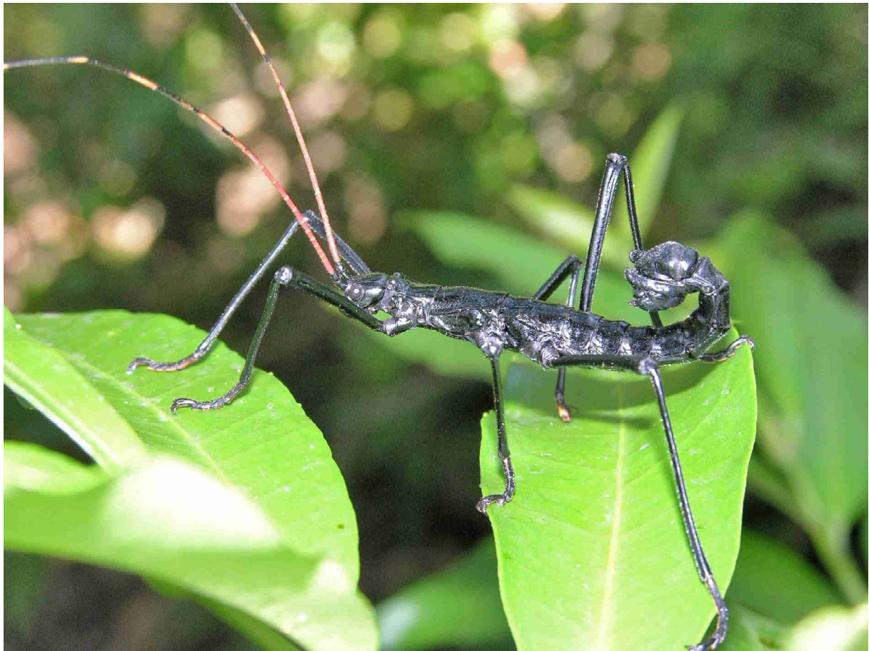
Fig. 1. Male of Autolyca elena sp.n. in living condition.

Рис. 1. Самец Autolyca elena sp.n. в естественной обстановке.