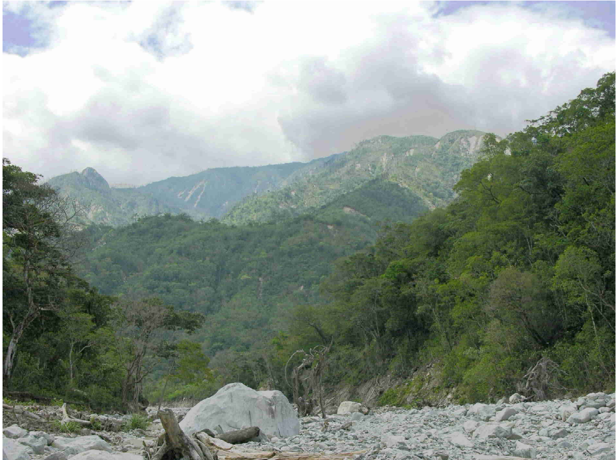
Fig. 14. Type locality of Autolyca elena sp.n.

Рис. 14. Типовое местообитание Autolyca elena sp.n.